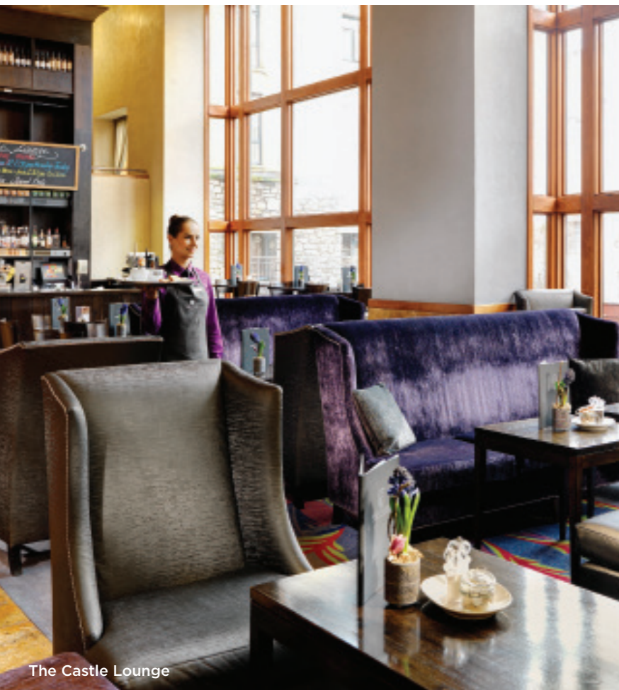
The Castle Lounge