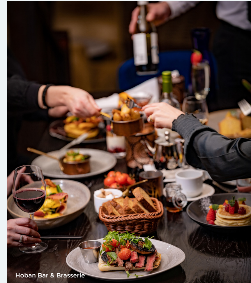
Hoban Bar & Brasserie