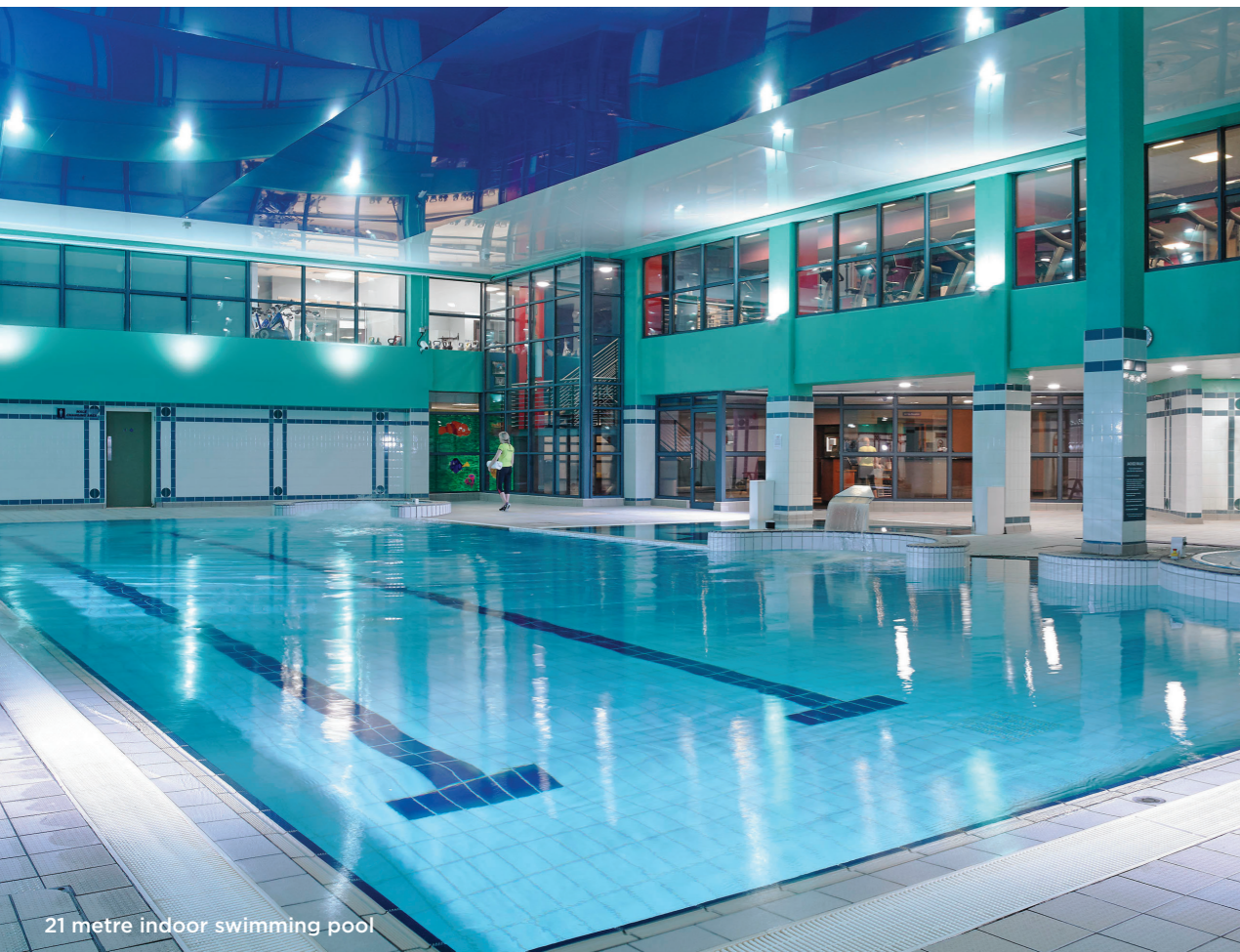
21 metre indoor swimming pool