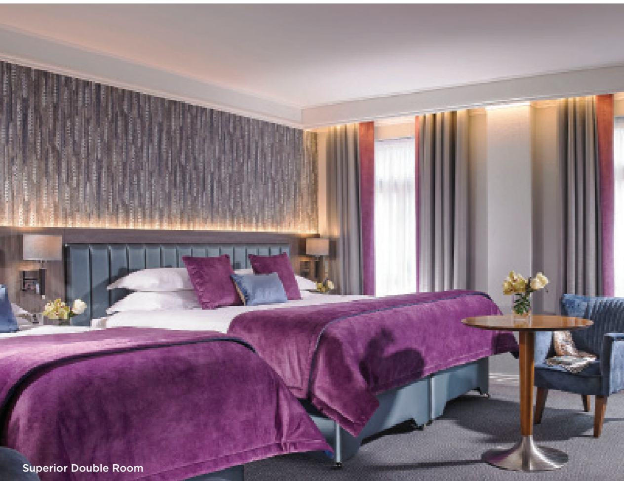
Superior Double Room